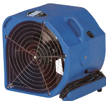
Quest Power Air Mover A3000 Air Mover System