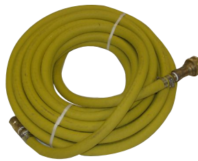
Glycol Distribution System