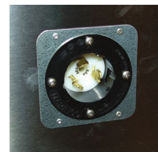
50 Amp Built-In Twist Lock Receptacle