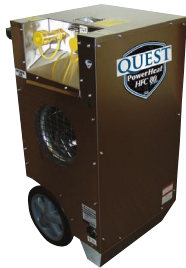
Quest PowerHeat HFC 80 Pro Hydronic Fan Coil for Glycol Heating Systems